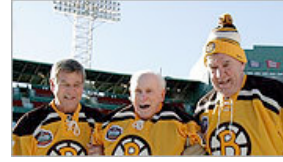
Bruins greets among first on the ice at Fenway Park