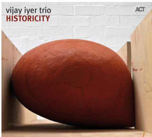
vijay iyer trio HISTORICITY