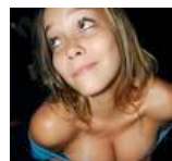
Best Club Photos of 2009